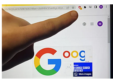
Google Chrome Users Can Now Block All Ads (Do it No... Removing ads is the first step to speeding up your browsing,... Safe Tech Tips